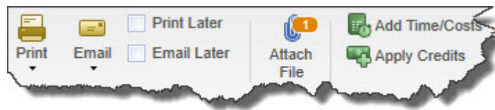
Figure 3: Many QuickBooks forms display the Attach File icon.

If you have supporting documentation for an invoice, for example, you can easily make it available from the form itself. Click the Attach File icon and select your file using the Doc Center's tools. Once you've added an attachment to a form, the icon will display the number of documents that are available there.